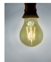
A60 - Classic