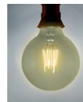
G95 - Globe