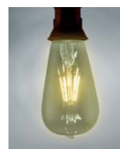
ST64 - Pear