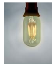
T45 - Tube